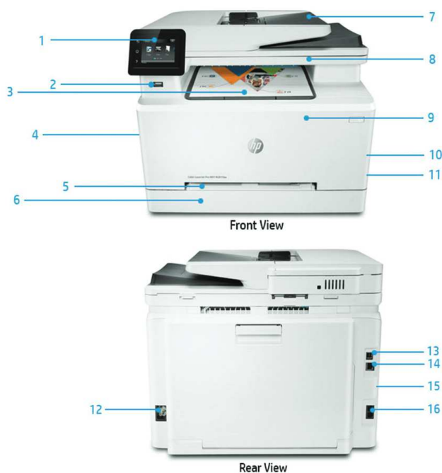
HP Colour LaserJet Pro MFP M281fdw shown