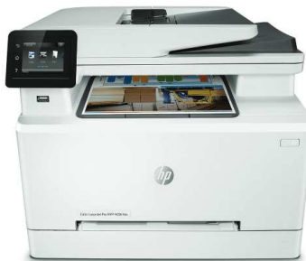
HP Colour LaserJet Pro MFP M281fdn