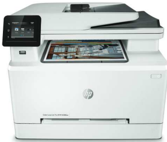
HP Colour LaserJet Pro MFP M280nw

Make an impact with high-quality colour and increased productivity. Get the fastest in-class two-sided printing speed and First Page Out Time (FPOT). 1,2 Scan, copy, and fax. 9 Count on simple security solutions, and get easy mobile printing. 3